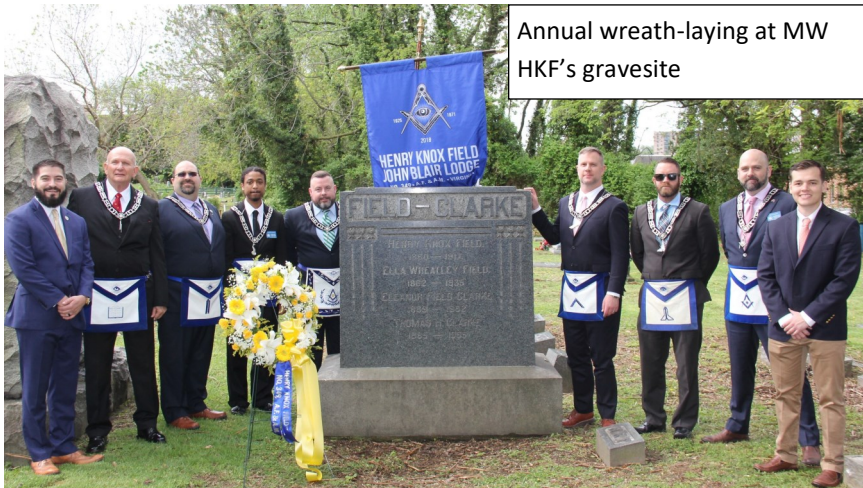
Annual wreath-laying at MW HKF's gravesite