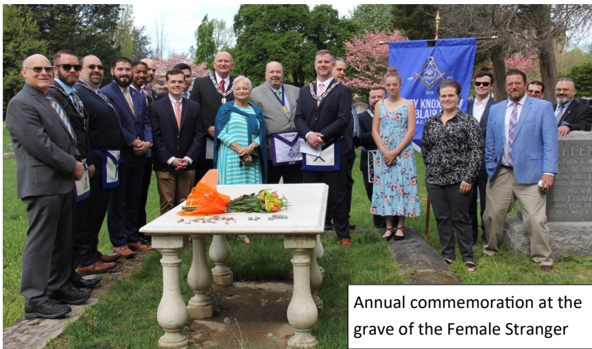
Annual commemoration at the grave of the Female Stranger

Message from the East, p. 2; Upcoming Events/Masonic Birthdays, p. 3; Wreath-Laying Photos, p. 4; Book of Constitutions: Concerning Private Qualities and Duties (cont'd), p. 5; Officer Contact Info, p. 6; Lodge History, p. 7.