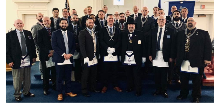
Official Visit by the DDGM and his District Team during February's Stated