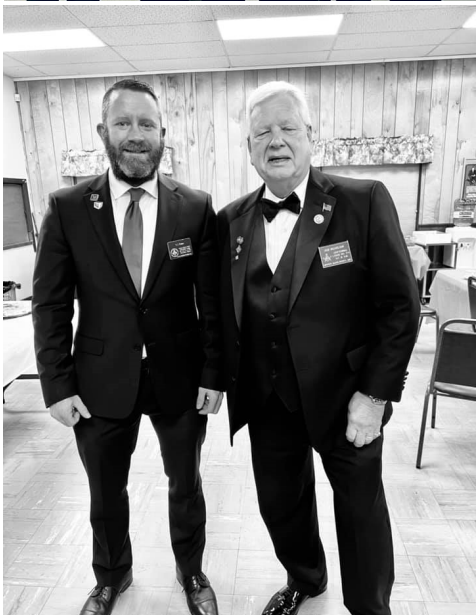
Centennial Lodge, No. 174 Upper Marlboro, Maryland Fraternal Visit A relationship that started in 1953