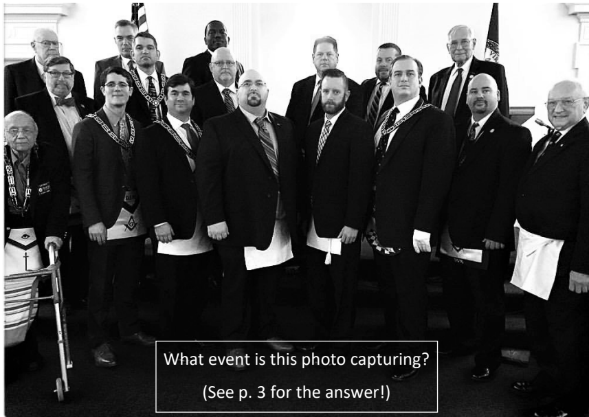
What event is this photo capturing? (See p. 3 for the answer!)