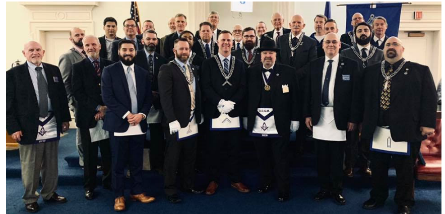
Official Visit by the DDGM and his District Team during February's Stated